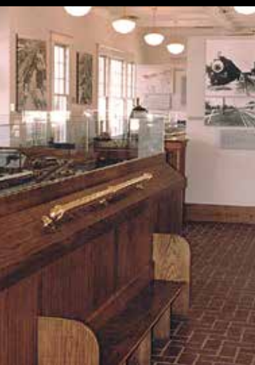
Enjoy exhibits of the Ennis Railroad and Cultural Heritage Museum.

Each April, the Ennis Garden Club sponsors the Bluebonnet Trails Festival, which highlights wildflowers and extends festivities into the city's historic downtown, where booths feature local arts and crafts, bluebonnet souvenirs, food and more. While in town, visit the Ennis Railroad and Cultural Heritage Museum, which showcases Ennis' rich railroad history and culture. Other attractions in Ennis include the Ennis Disc Golf Course, Bluebonnet Park, Ennis Veterans Memorial Park, Lions Park, and numerous other parks and lakes, 144 nationally registered historic landmarks, historic driving tours and memorials. Take a trip down memory lane at the nearby Drive-in Theatre, north of Ennis, or catch a live play at Ennis' two public theatres. Recreational opportunities include tennis, nature trails, bowling, and much more.