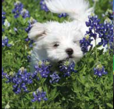
Ennis welcomes more than 100,000 visitors each year to our 40 miles of Bluebonnet Trails sponsored by the Ennis Garden Club.

Some of the most beautiful sights in this great country are right here in Ennis. Just a 30-minute drive south of Dallas, there's a 40-mile stretch of bluebonnet-covered land that is so remarkable it has been designated the "Official Texas Bluebonnet Trail" by the Texas Legislature. Don't forget the camera. Precious photo opportunities abound.