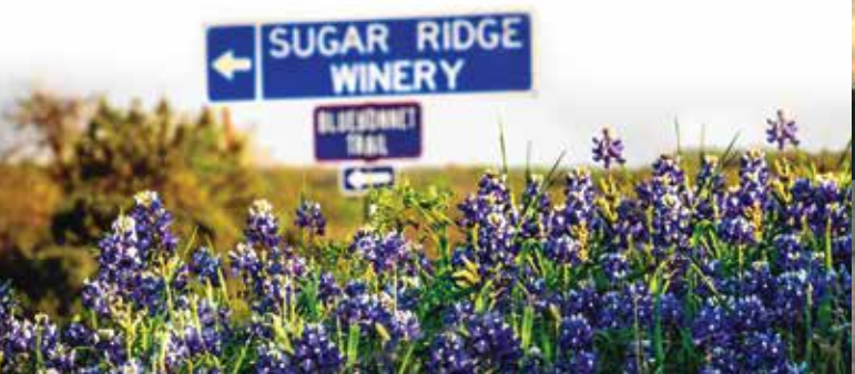
Bluebonnet Trails are in April only.

Beautiful bluebonnets are just part of the picture in Ennis. When it comes to exploring nature's best, you can sail, ski and fish on beautiful Lake Bardwell, or picnic or camp in one of the lake's parks. While in town, stroll along Kachina Prairie, one of Texas' preserved blackland prairies. Discover native plants that have remained since Texas' early settlers traveled across these untouched grasslands. Another great place to enjoy the breathtaking rolling hills of Ellis County is at the Sugar Ridge Winery! The winery, located just northeast of Ennis, is the perfect place to sip a glass of wine while enjoying the beautiful countryside.