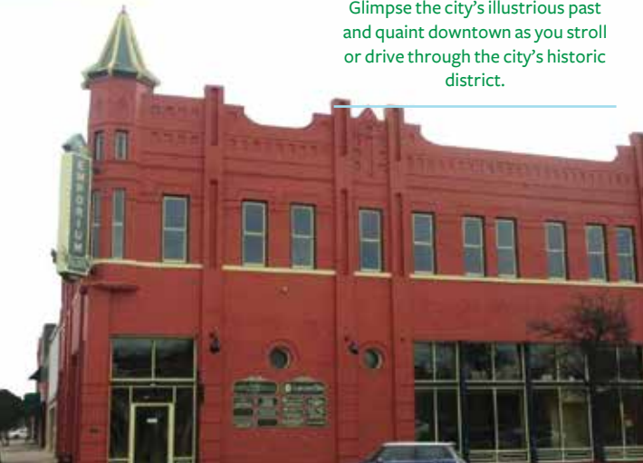
Glimpse the city's illustrious past and quaint downtown as you stroll or drive through the city's historic district.