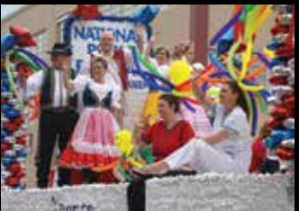
The colorful National Polka Festival parade is a crowd favorite each May.

Ennis is very proud of its multicultural heritage and the events that celebrate its diversity! There is one special weekend that celebrates Ennis' Czech heritage to the hilt. Each Memorial Day weekend, people come from far and wide to take in the sights, sounds, tastes and smells served up three days straight at the National Polka Festival. Enjoy Czech tradition at its best from polka dancing downtown and at the three dance halls to music, polka mass, kolaches, and crafts. A colorful parade highlights the festivities. Every Christmas season, the festive "Lights of Ennis" adorn the downtown district. Holiday activities include the Christmas Parade of Lights and Block Party!