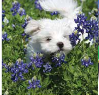
Ennis welcomes more than 100,000 visitors each year to our 40 miles of Bluebonnet Trails sponsored by the Ennis Garden Club.

Some of the most beautiful sights in this great country are right here in Ennis. Just a 30-minute drive south of Dallas, there's a 40-mile stretch of bluebonnet-covered land that is so remarkable it has been designated the "Official Texas Bluebonnet Trail" by the Texas Legislature. Don't forget the camera. Precious photo opportunities abound.