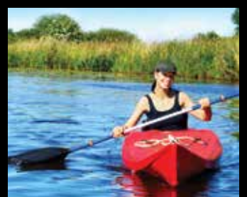
Enjoy recreational opportunities at Ennis' area lakes.