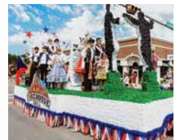
The colorful National Polka Festival parade is a crowd favorite each May.

Ennis is very proud of its multicultural heritage and the events that celebrate its diversity! There is one special weekend that celebrates Ennis' Czech heritage to the hilt. Each Memorial Day weekend, people come from far and wide to take in the sights, sounds, tastes and smells served up three days straight at the National Polka Festival. In June, celebrate Unity in the Community's Blues on Main event, featuring Jazz and R&B music, family friendly activities, great food, and more. Every Christmas season, the festive "Lights of Ennis" adorn the downtown district. Holiday activities include the Christmas Parade of Lights and Block Party.