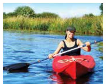
Enjoy recreational opportunities at Ennis' area lakes.

Beautiful bluebonnets are just part of the picture in Ennis. When it comes to exploring nature's best, you can sail, ski and fish on beautiful Lake Bardwell, or picnic or camp in one of the lake's parks. While in town, stroll along Kachina Prairie, one of Texas' preserved blackland prairies. Discover native plants that have remained since Texas' early settlers traveled across these untouched grasslands. Another great place to enjoy the breathtaking rolling hills of Ellis County is at the Sugar Ridge Winery! The winery, located just northeast of Ennis, is the perfect place to sip a glass of wine while enjoying the beautiful countryside.