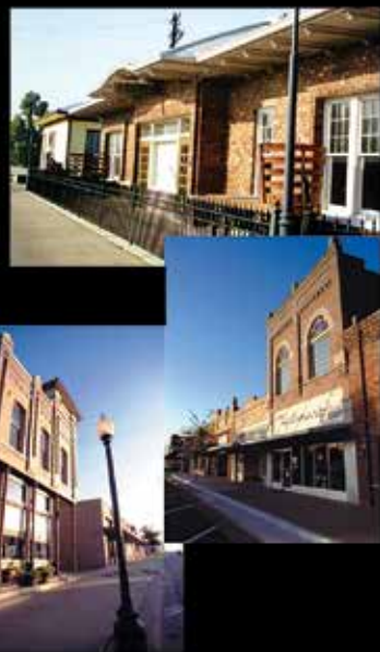
Glimpse the city's illustrious past and quaint downtown as you stroll or drive through the city's historic district.